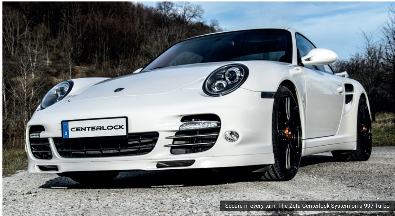
Secure in every turn: The Zeta Centerlock System on a 997 Turbo